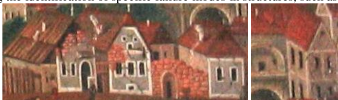
Figure 1. Shear failure in structural masonry walls due to the 1763 earthquake (anonymous’ depiction)

The use of the method in [4] implies stressing the seismic modelling work, which for real historical structures usually reveals to be a complex case dependent task. An alternative route is to generate archetypes using the knowledge of the buildings of interest [9] usually available in bibliography and local historical building surveys [10]. This option is particularly relevant when records of real affected buildings are not available, or exist but do not provide a representative sample of the damaged buildings. Historical sources identify the most affected buildings as two storey rigid buildings, made of burnt clay bricks, rather than simple and more flexible peasant houses, made of earthen or adobe masonry. In total, out of 1169 houses in total, 279 ended completely destroyed, 353 partially collapsed, 213 needed expensive repair and 219 cheap repair [2]. Furthermore, an anonymous painter depicted the damage in the city of Komárom after the 1763 earthquake, enabling the identification of specific failure modes in structures, such as shear failure (fig. 1).