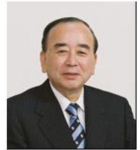
Kano, Noriaki, Prof. Dr. Honorary Member Board Advisor