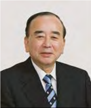
IAQ Honorary Member Noriaki Kano, ASQ Honorary Member