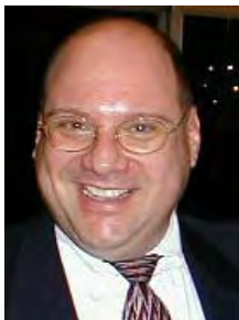
Academician Glenn Mazur for presentation entitled "Design for Customer Satisfaction using QFD and ISO 16355" at EOQ Congress 2014 in Gothenburg, Sweden