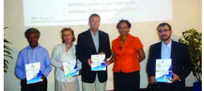
The UNESCO Team at the Seychelles ceremony “National Curriculum Framework”.

the same time pilot projects are being undertaken in the E-9 countries, where more than half of the world’s population lives. The Education (E)-9 countries include: Bangladesh, Brazil, China, Egypt, India, Indonesia, Mexico, Nigeria and Pakistan. In these countries, there are special challenges in terms of global quality education. Nevertheless, it should be noted that poor quality education can be found both in developing countries and in developed countries.