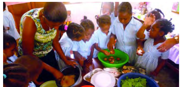
Visiting a school in Seychelles.

In order to further strengthen the collaboration between UNESCO and IAQ and to gain first-hand experience I, as the Chairman of IAQ QiETT, was invited by UNESCO to act as an observer at the Seychelles National Workshop on GEQAF, where the Ministry of Education gladly welcomed UNESCO’s request for my participation.