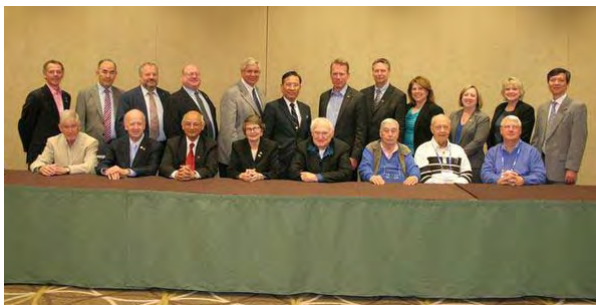
Academicians at General Meeting in Indianapolis