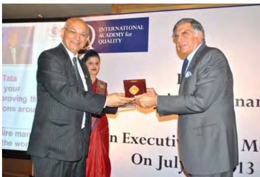
BqiGM to Mr Ratan Tata, Chairman Emeritus, Tata Sons in Executive model Category for 2013 with President