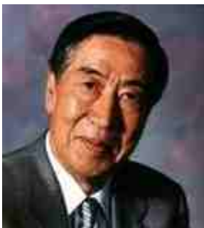
Dr. Genichi Taguchi January 1, 1924 – June 2, 2012

Dr. Genichi Taguchi died in Tokyo on June 2, 2012 at the age of 88. He had risen from humble beginnings to become one of the most influential people in Quality Engineering. He has made pioneering contributions to Japanese and US industry. His Quality Engineering methods consist of both off-line and on-line quality control techniques. In particular, Taguchi's methods for robust parameter design have had a profound impact on the way experimental techniques are used to address the core needs of engineering [Read more]