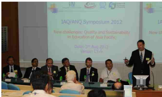
QIETT session held on 3rd August 2012 in Hong Kong