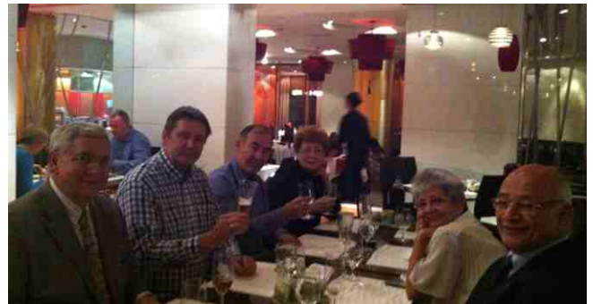
IAQ Dinner on 24th November 2012, at Hotel Shangrila, New Delhi.

Response from UNESCO has been positive. A meeting with UNESCO was happened on March 2012. Our application has been forwarded to their legal department. A Symposium on Quality in Education has been planned during the ANQ Congress scheduled in Hong Kong on August 3, 2012. Planning is to achieve an UNESCO consultative status by the end of the year 2012.