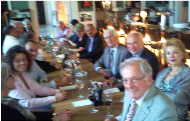
June 16, 2012 in Frankfurt, Hesse, Germany