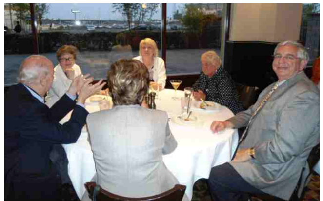
May 19, 2012 at Anaheim, Ca, USA